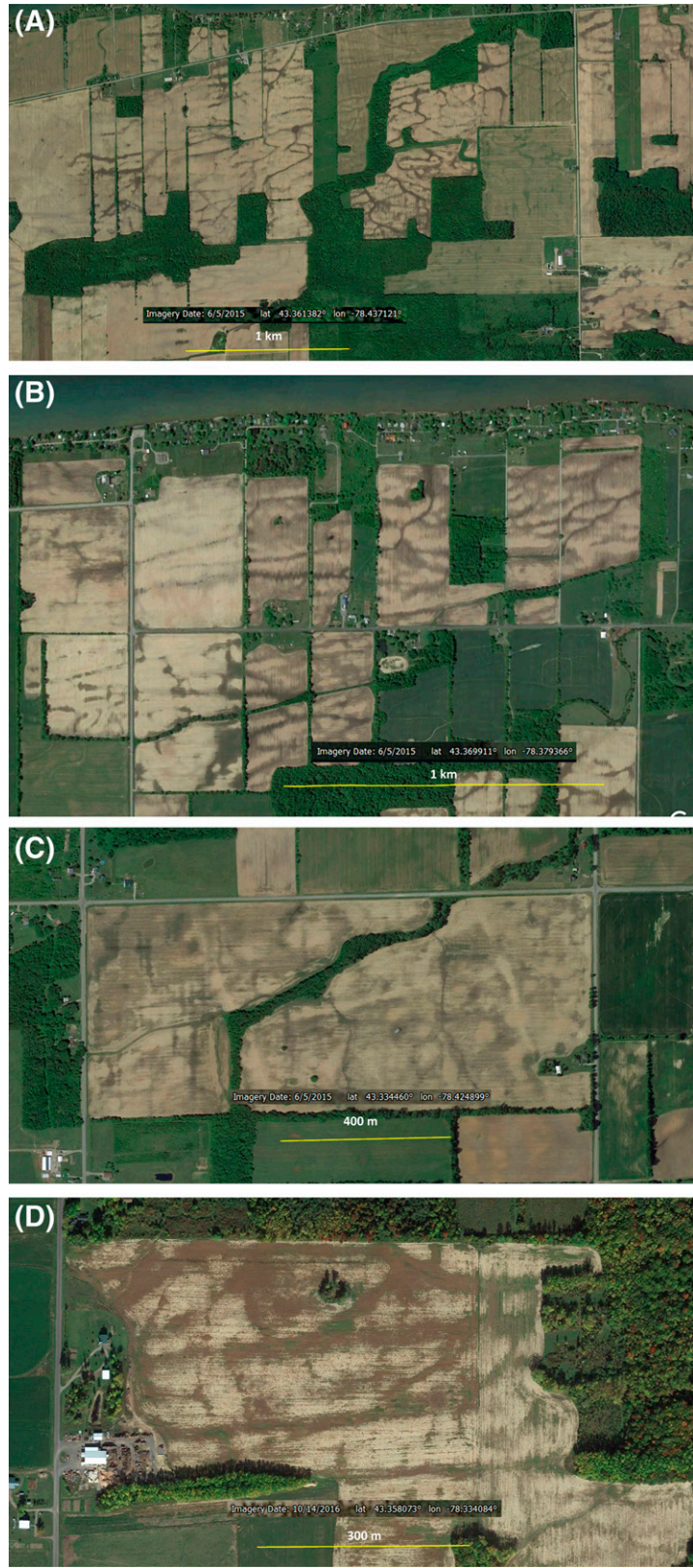
Figure S3. Four Google Earth images of east-northeast lineaments defined by soil moisture and vegetation along the Niagara frontier between Buffalo and Rochester, New York. The latitude (lat) and longitude (lon) in each figure indicate the approximate locations of the center of each image. Locations of figures (A)–(D) are shown in Figure S2.