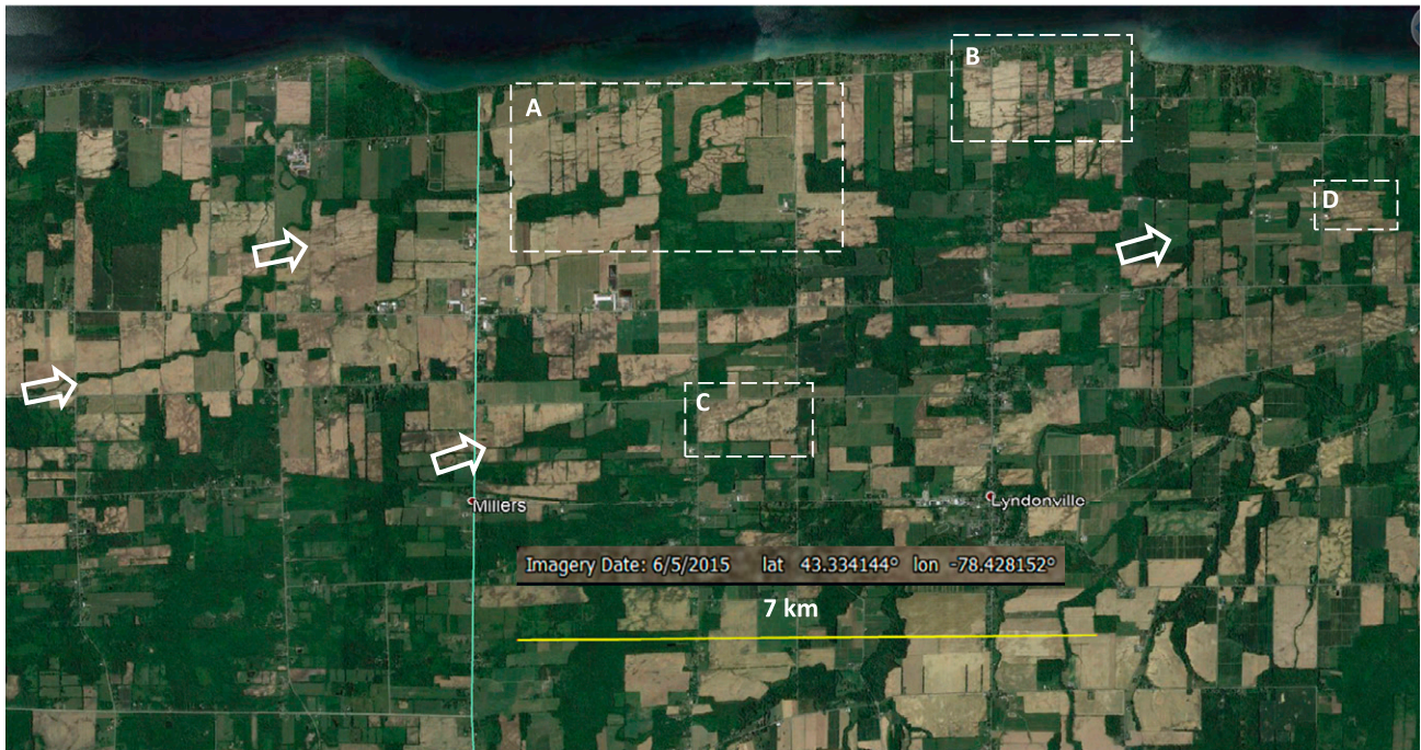
Figure S2. Google Earth image of the Niagara frontier between Buffalo and Rochester, New York. East-northeast lineaments of up to 7 km in length are denoted with white arrows. The location of the four images presented in Figure S3 are indicated with dashed boxes labeled A, B, C, and D. The latitude (lat) and longitude (lon) indicate the approximate location of the center of the image.

(2001) interpret the displacement of east-northeast joints in Ithaca, New York, by slip on J2 joints as an indication that the east-northeast joints were early (i.e., J1 joints). We did entertain the possibility that such displacement was a consequence of glacial shove. Presently, we feel that the glacial shove hypothesis deserves further consideration.