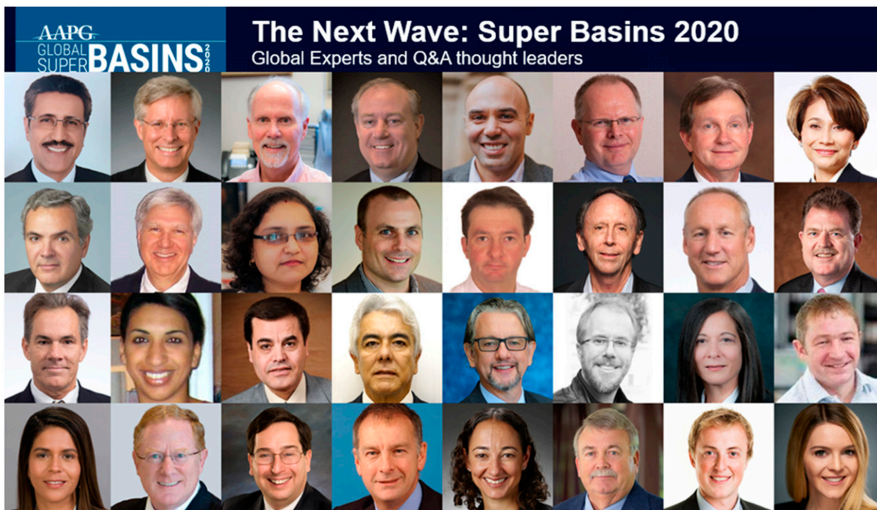
Super Basin Speakers and thought leader panels, February 11–13, 2020.