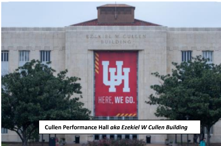
Cullen Performance Hall aka Ezekiel W Cullen Building

Distance from the Hilton Parking Garage = 2 city blocks Distance from the Welcome Center Parking Garage = 3 city blocks