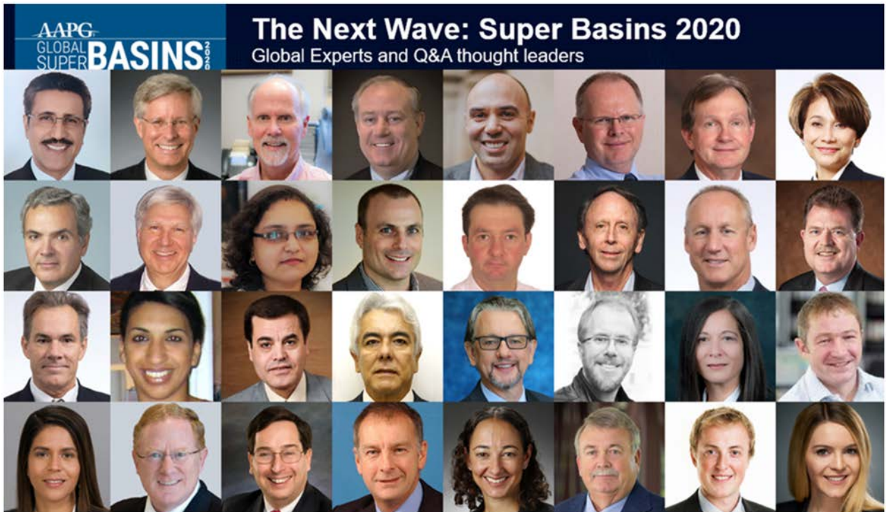
Super Basin Speakers and thought leader panels, February 11–13, 2020.