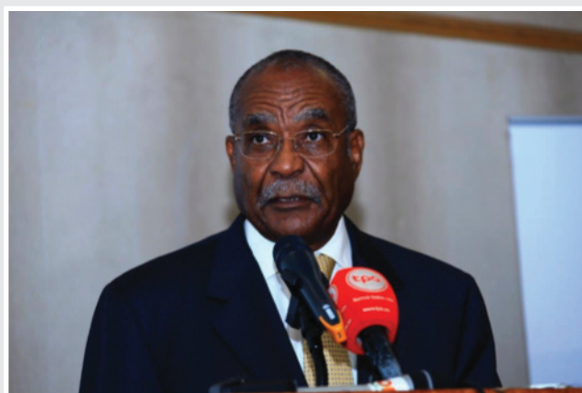
Angolan Minister of Petroleum delivers keynote speech.