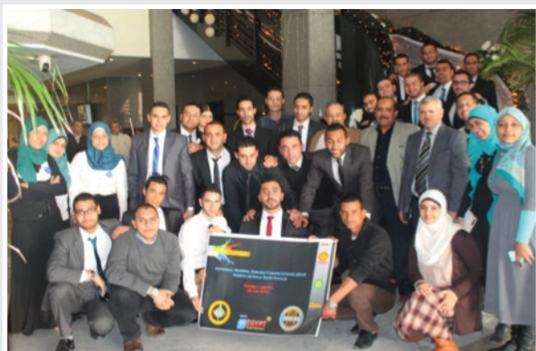
IBA North Africa semi-finals in Cairo, 2014

North Africa IBA semi-finals took place in Cairo on 22 February with the Faculty of Science, Tunis El Manah University taking first position, followed by Helwan University, Egypt in second place. Both schools represented North Africa in the finals competition. Sub-Saharan semi-finals took place on 27 February in Lagos, Nigeria. The University of Western Cape, South Africa scored first in this competition, followed by University of Lagos, Nigeria in second place. Both teams represented South Africa at the finals.