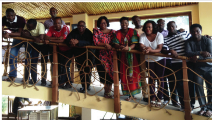
NAPE-AAPG leadership and YPs at TerraKulture in Lagos.

Looking ahead, there is no doubt that the YPs have a strategic role to play in the future of hydrocarbon exploration and development in Africa. In