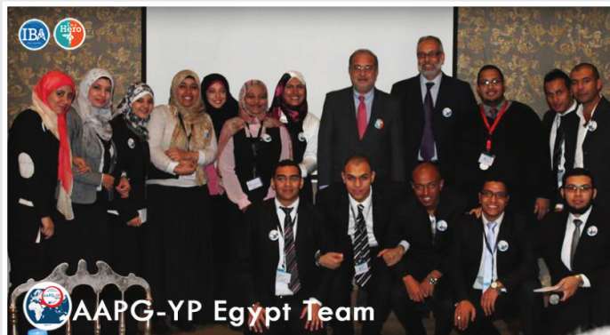
AAPG-YP Egypt team in group photo with Egypt Minister of Petroleum, Engr. Sherif Ismail (standing, fifth from right) at the concluding ceremony of the IBA simulation in Cairo.