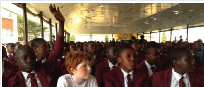
Students from Greensprings school at “The Exciting World of Geology” career talk in Lagos, February 2014.

For anyone interested in speaking at a school around them, “The Exciting World of Geology” CDs are available at the AAPG Africa Office. Alternatively, they can be mailed upon request.