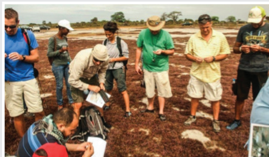
Mussulo Bay field trip, Angola