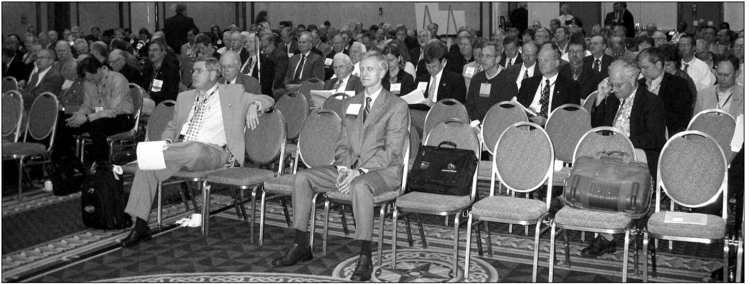
House of Delegates in session at the 2007 annual convention at Long Beach, California.