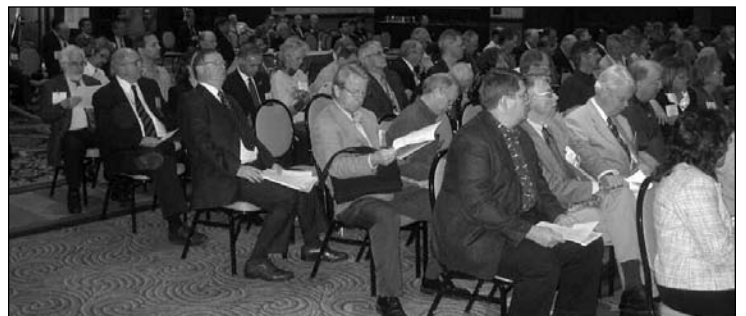
2006 House in session