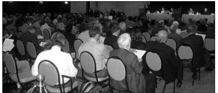
2006 House in session