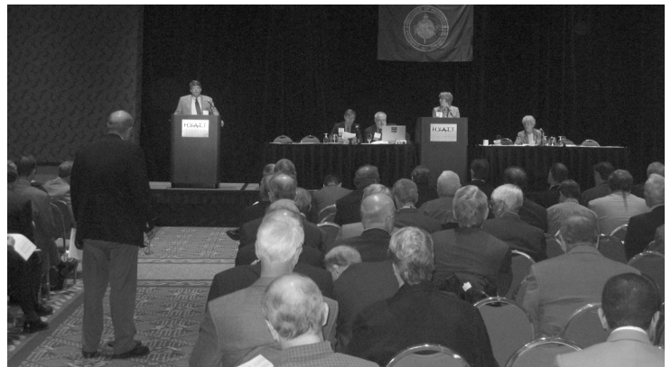
"House in Action" HoD Annual Meeting Calgary, AB, Canada June 19, 2005

12. Meetings of Delegates to discuss Association affairs are encouraged especially prior to the annual convention. Region and society officials should be invited to attend. ♦