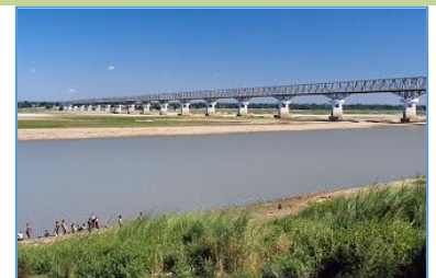
Irrawaddy Bridge, Magway