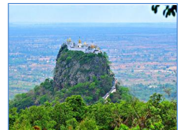
Taung-Ka-lat, Mount Popa