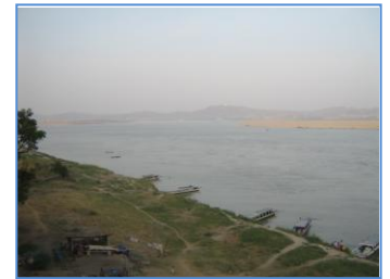
East bank of Irrawaddy, Bagan