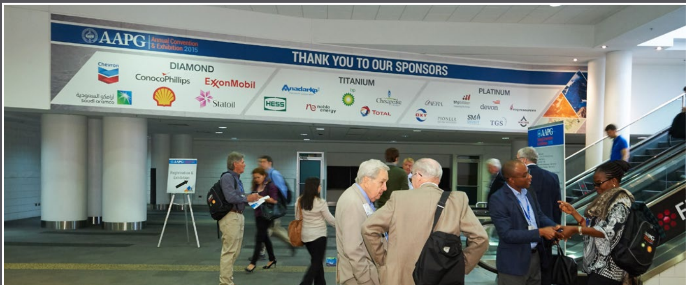
All sponsors recognized in highly visible locations.