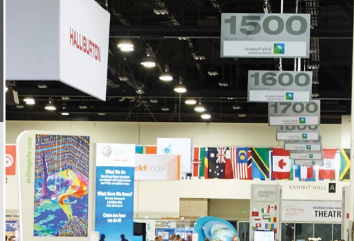
Aisle sign sponsorship.